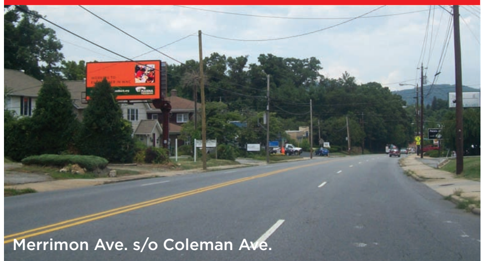
Merrimon Ave. s/o Coleman Ave.