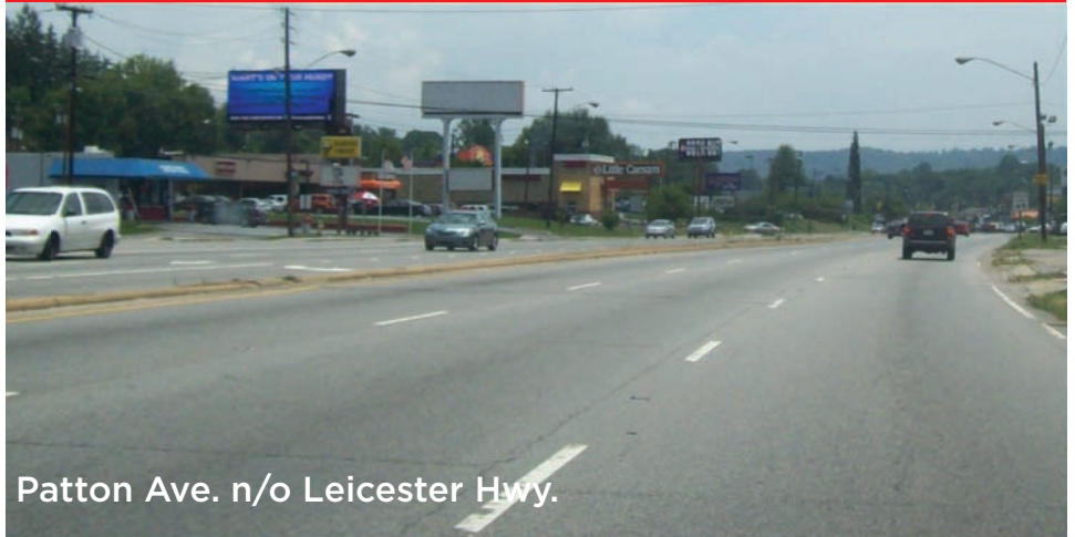
Patton Ave. n/o Leicester Hwy.