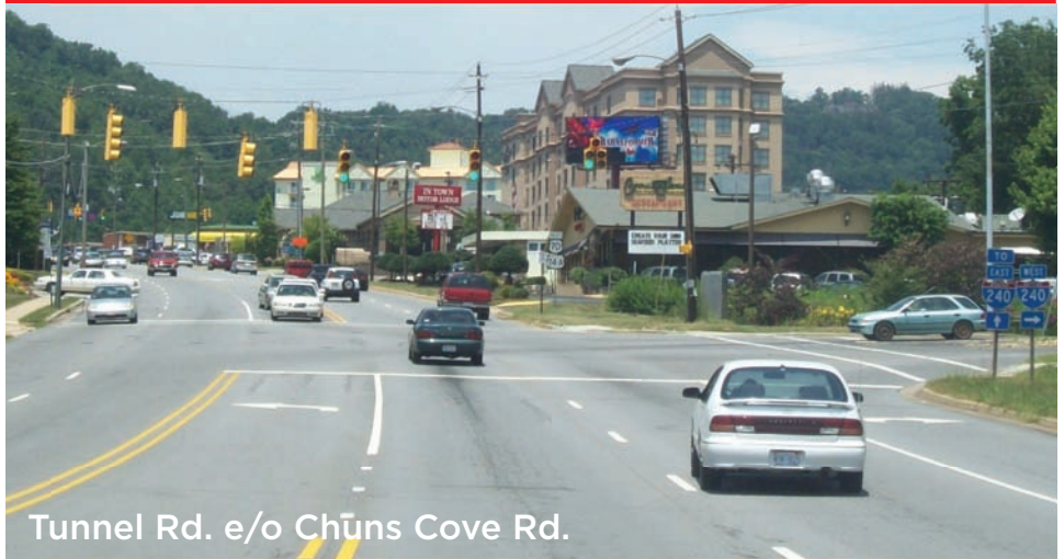
Tunnel Rd. e/o Chūns Cove Rd.