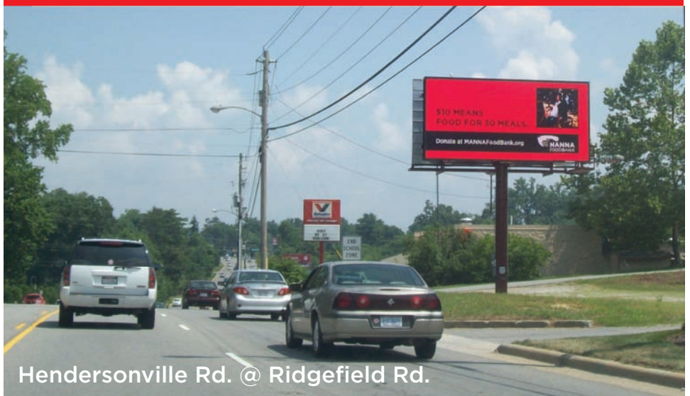
Hendersonville Rd. @ Ridgefield Rd.